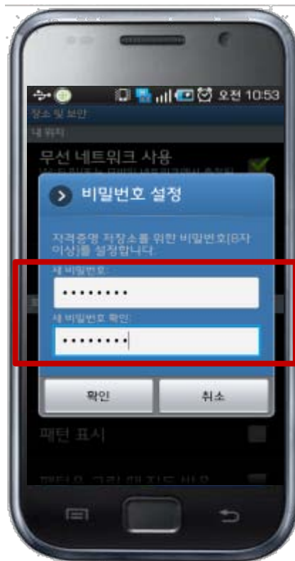
5. Input the any number (8 characters)