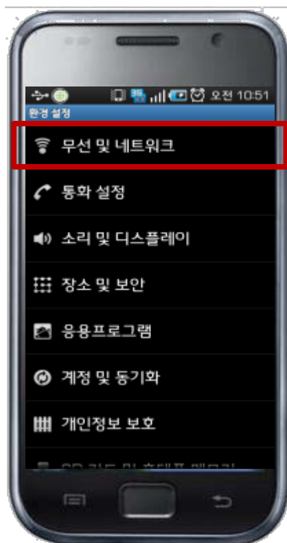
2. Choose the Wireless and network