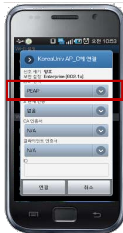
6. EAP - Choose the PEAP (default)