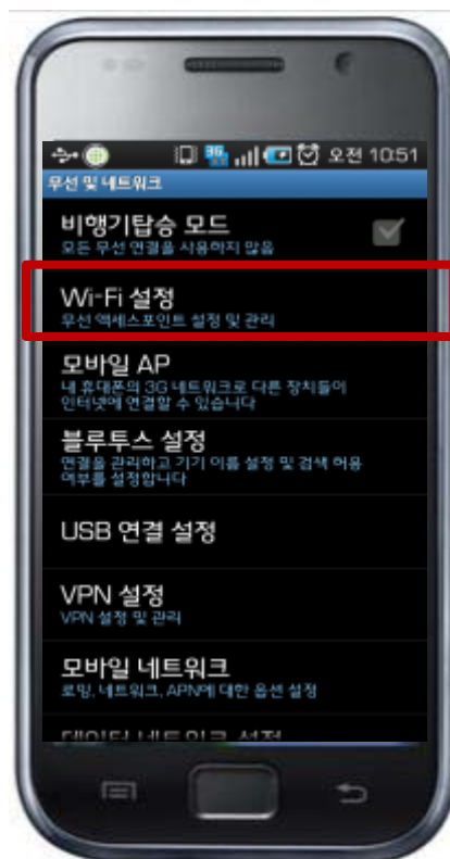
3. Set-Up Wireless and Network Wi-Fi