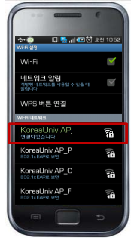
8. Successful Connection of Wireless Lan