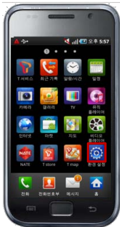
1. Environment Set-Up