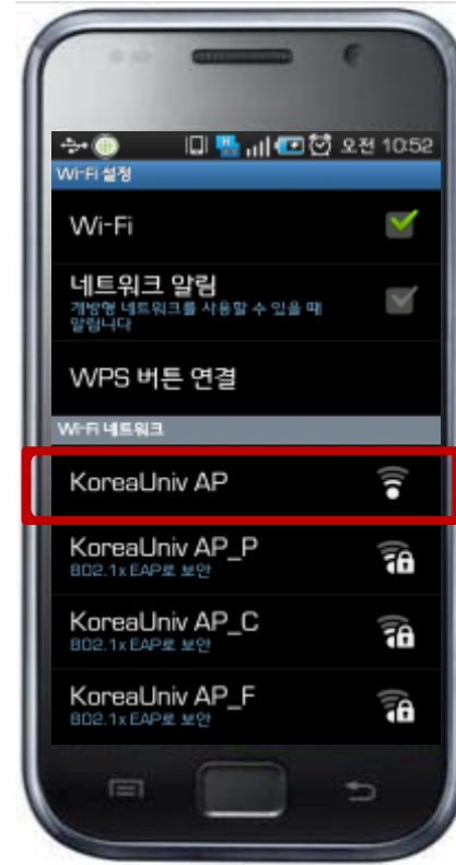
4. Check the Wi-Fi Article and Choose the SSID